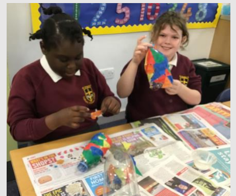
Making plastic bottle fish

Aspiration-Resilience-Awareness-Compassion