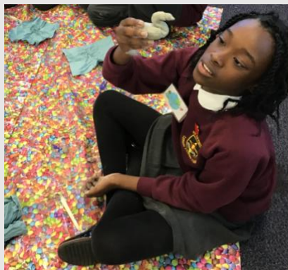
Creating a new creature