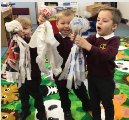
Making plastic bag jellyfish