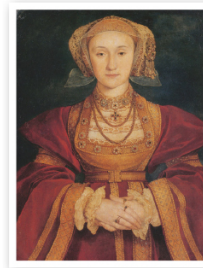
Anne of Cleves by Hans Holbein

Holbein was a German artist and portrait painter. He travelled to England in 1532 with the backing of Anne Boleyn and Thomas Cromwell. In 1535, he became the King's Painter. Holbein painted many portraits of the royal family and the nobles. He was also asked to paint a picture of Anne of Cleves so Henry could decide if he wanted to marry her. Henry liked the portrait but the marriage only lasted six months because Anne didn't look as beautiful in real life as she did in her portrait.