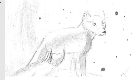
Emmanuel's Arctic Fox