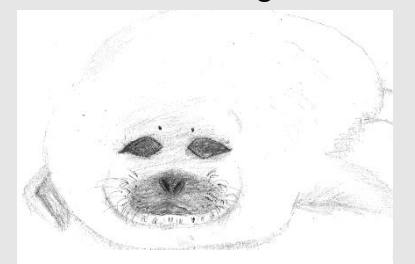
Victoria's Arctic Seal