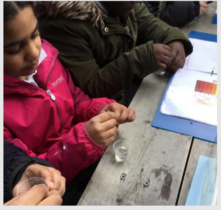
Please see the <u>gallery</u> on the school website for more photos of our day.