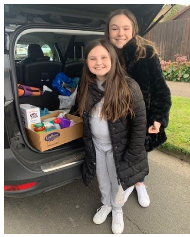
Good deeds during Lockdown— Food Bank Delivery