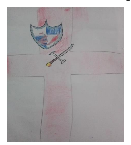
Celebrating St. George's Day! Spotting signs of Spring over

Keep sending in your news. We will try and share all of them over time.