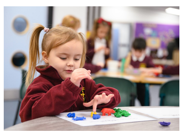
"Walking Together in the Light of the Lord"

We strive for excellence in teaching and an enjoyment of learning; in a setting underpinned by Gospel values and practices. Our highly skilled staff in Nursery set consistently high expectations in all that they do and ensure St Gregory's is a place where we help to make long-lasting memories and we feel privileged to be able to be at the beginning of children's learning journeys.